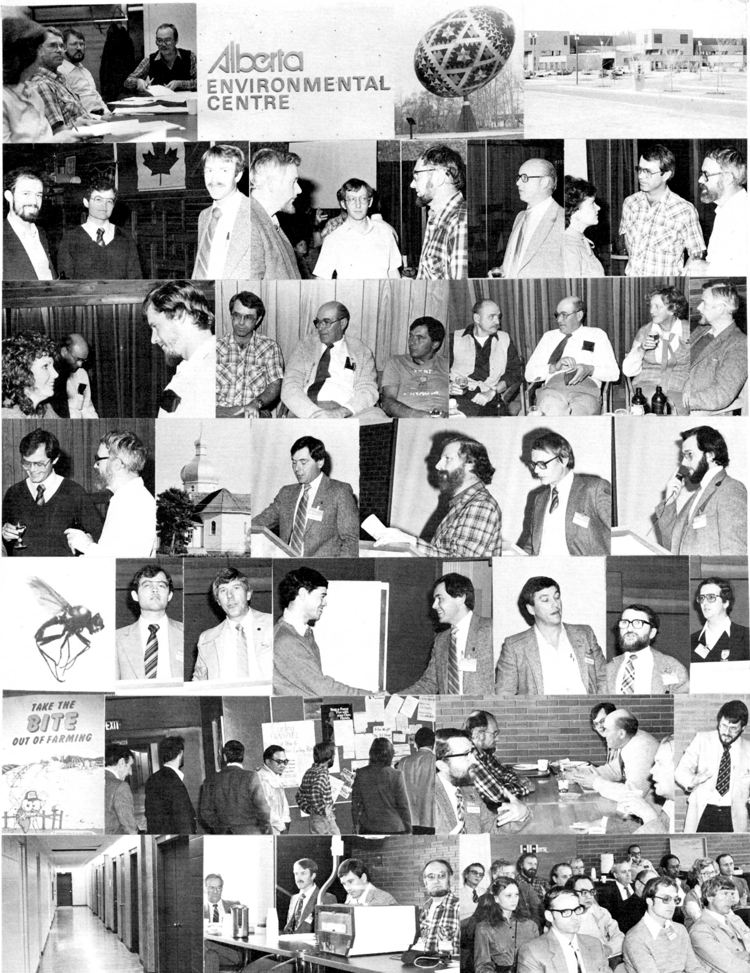
THIRTIETH ANNUAL MEETING - VEGREVILLE - 1982